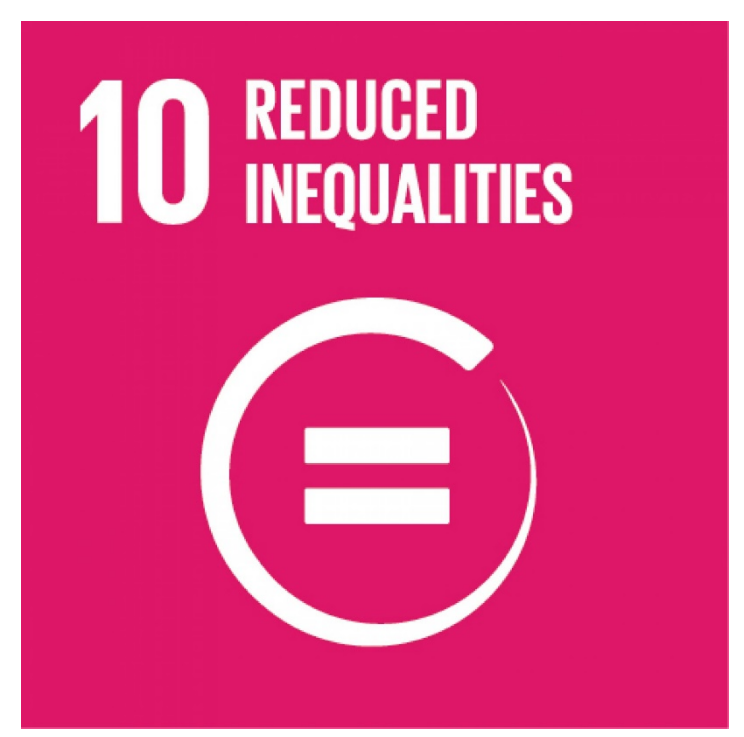
SDG 10. Reduce inequality within and among countries.